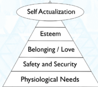
Maslow's Hierarchy of Needs

me to CHC's approach through a run-through of the new building from the perspective of a new 'customer'. He emphasised that I could be anyone in need of help and need not necessarily be homeless – they cater to the isolated elderly, disaffected youth and refugee and traveller demographics too, as well as local residents who may need anything from advice to a training course. However, on coming to CHC the first thing I could expect would be a raft of questions to determine my situation and how CHC might best be able to help.